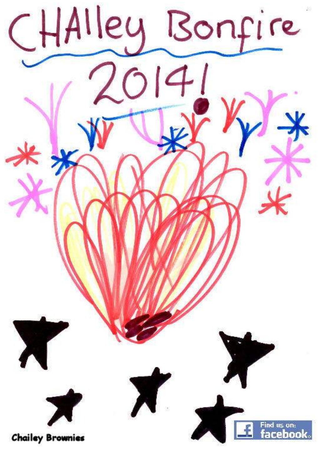
8<sup>th</sup> November 2014